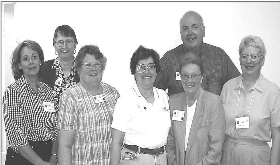
New LWVAZ Board

On August 26, 1920, the 19 th Amendment granting women the right to vote was certified as part of the United States Constitution. Referred to as the Susan B. Anthony amendment, it states, "The right of citizens of the United States to vote shall not be denied or abridged by the United States or any State on account of sex." In 1971 Congress designated August 26 as "Women's Equality Day" as a reminder of women's first efforts to gain political equality. In 2002, three states—Arizona, Kansas and Oregon—will celebrate the 90 th anniversary of women in their states winning the right to vote.